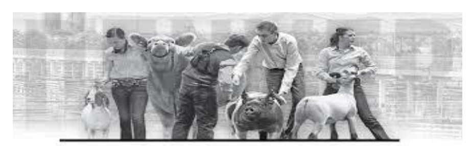
JANUARY 6-21, 2018 • DENVER

Online Registration for LDC will be offered through 4HOnline beginning December 4<sup>th</sup>, 2017. If you are interested, please let you're Club Leader or the 4H Office know. There are funds available to help defray your registration expenses. Pre-registration by January 9<sup>th</sup>, 2018