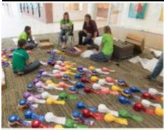
Colorado 4-H State Conference Begins